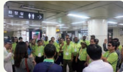
Field Trip-Seoul-Metro Theme Toilet