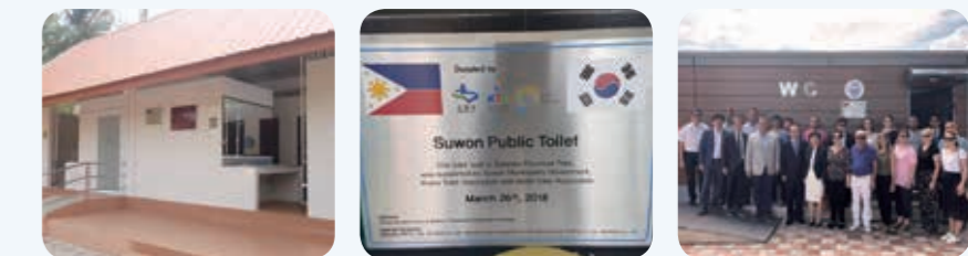
That Luang Toilet, Vientiane, Laos