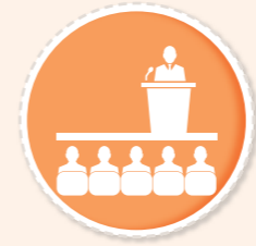
International Toilet Culture Conference