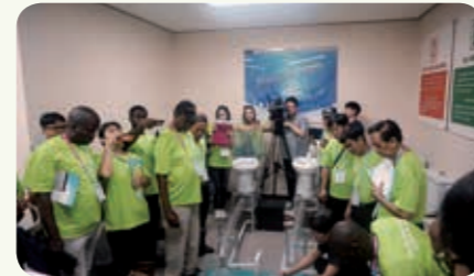
Field Trip-Water Saving Toilet