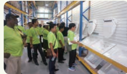
Field Trip-BATH EXPO