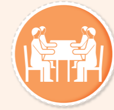
WTA General Assembly and Board of Directors Meeting

The International Toilet Culture Conference will be held as an additional event, which will be held with each sub-theme depending on the host country. In the conference, experts from around the world will make a presentation about the pending issues to achieve UN SDG6, water and sanitation. Next generation toilet technology products which include water conservation technology are exhibited in conference hall. In addition, WTA operates technical tours for participants to experience advanced toilet technology or problem of the toilet situation.