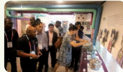
Field Trip-Toilet Museum